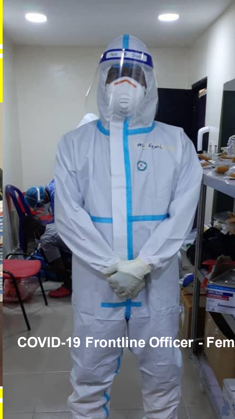
COVID-19 Frontline Officer - Fem